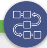
Integration with Site