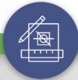
Renders and Sketches